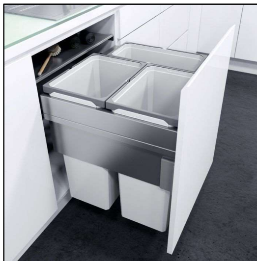
Figure 5.2 Example three bin storage system to be provided within the unit design

Provision will be made in all residential units to accommodate 3 no. bin types to facilitate waste segregation at source. An example of a potential 3 bin storage system is provided in Figure 5.2 below.