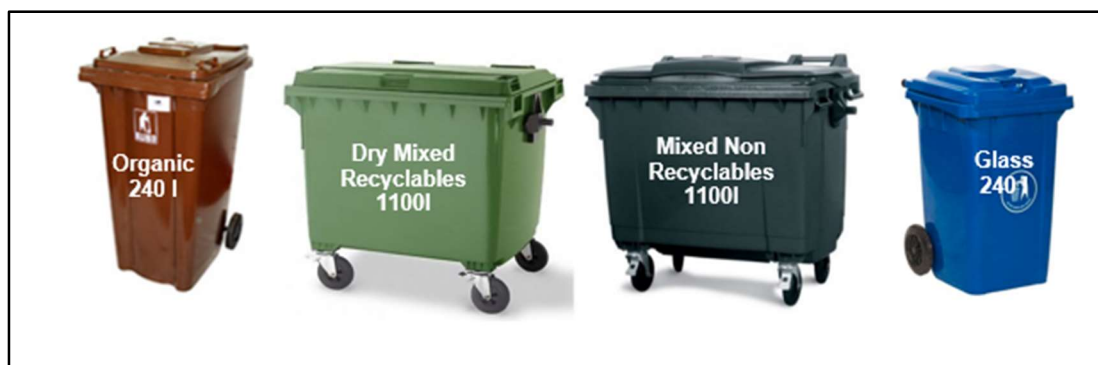
Figure 5.1 Typical waste receptacles of varying size (240L and 1100L)

The types of bins used will vary in size, design and colour dependent on the appointed waste contractor. However, examples of typical receptacles to be provided in the WSAs are shown in Figure 5.1. All waste receptacles used will comply with the SIST EN 840-1:2020 and SIST EN 840-2:2020 as the standards for performance requirements of mobile waste containers, where appropriate.