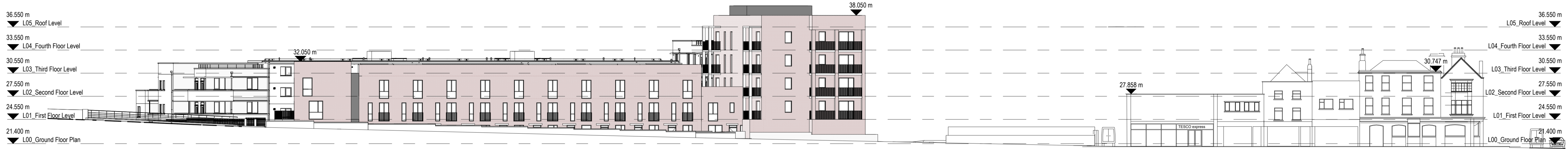
2 Contextual Elevation Dolphin's Barn Road 1:250