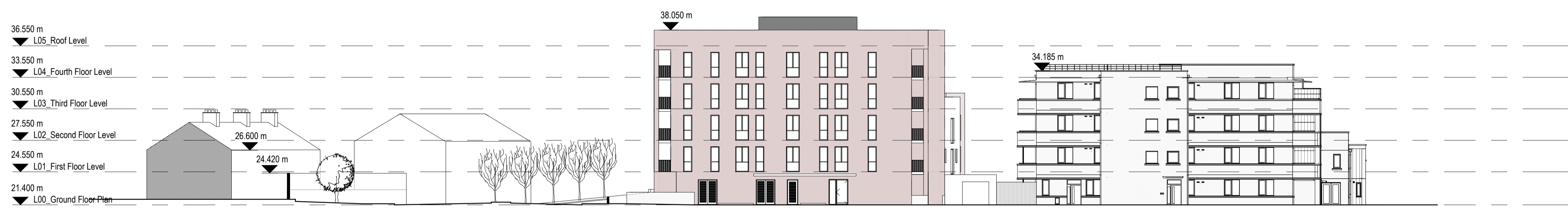
3 Contextual Elevation Estate Road 1:250