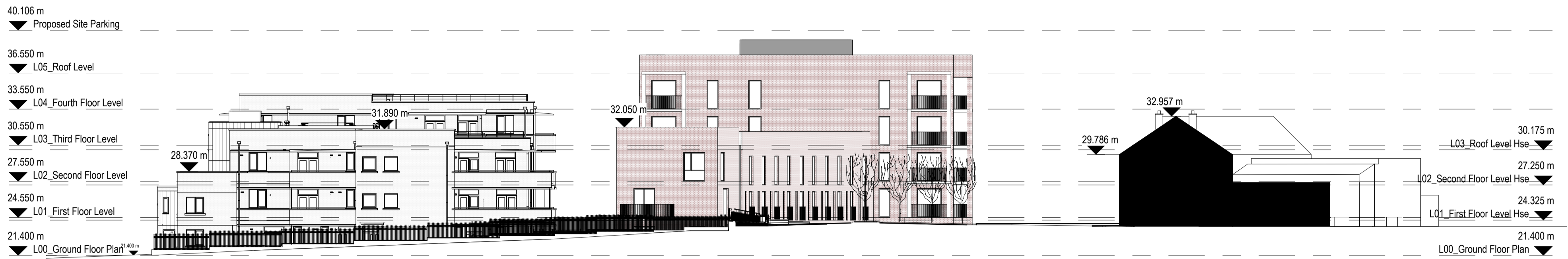
1 Contextual Elevation Canal Side 1:250