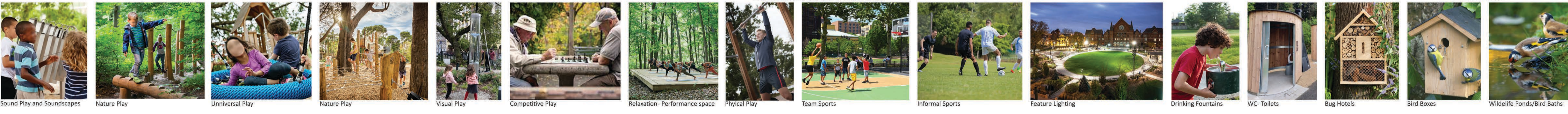
Proposed Material Palette - Reference images