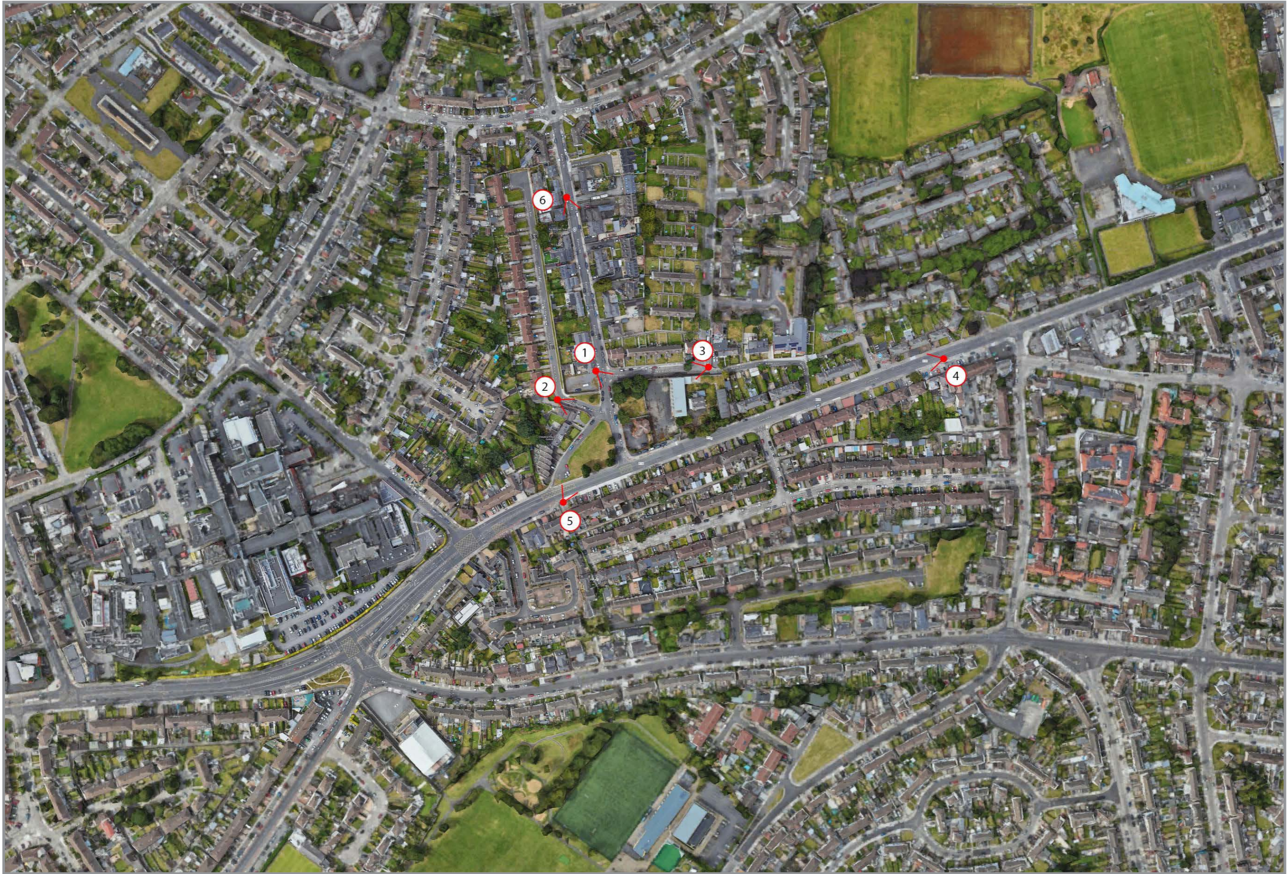
View Location Map

This map is for view location purposes only. Please refer to Architects drawings for site layout and redline boundary.